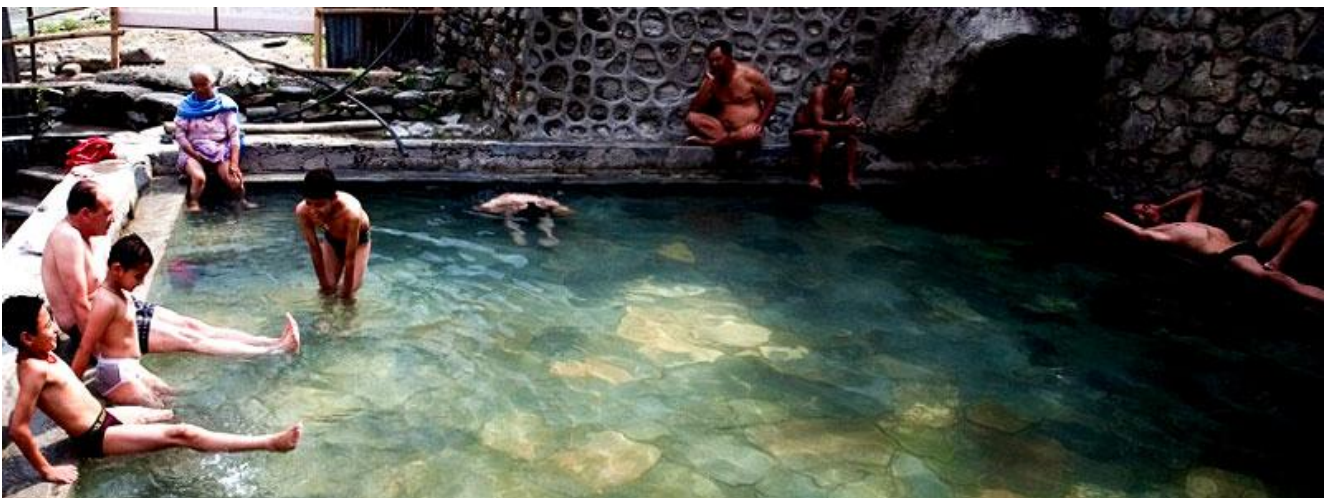
Natural Hot Spring in Annapurna