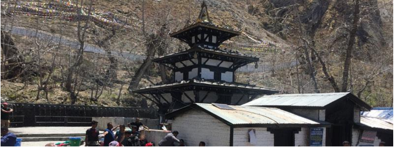
Muktinath Temple Image