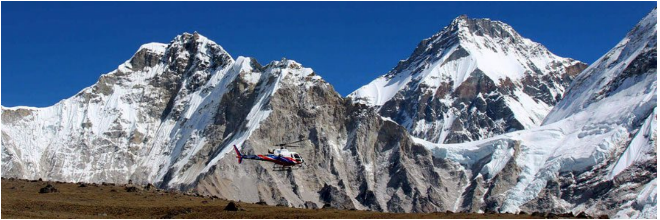
Everest Helicopter trekking image

Similarly, Are you wondering about Everest trekking by helicopter, Cost and price details, itinerary, Guide, Permits, and Helicopter for 2024 and 2025? Contact us now on WhatsApp at +977 9851033819 or email us. If you have time, look at Everest's trip video .