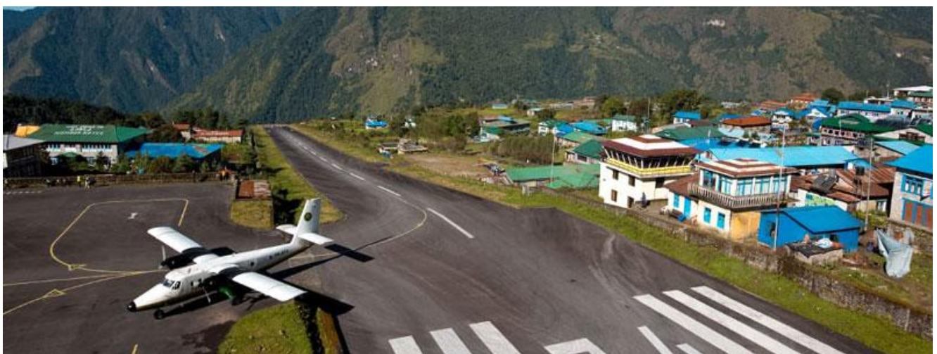
Everest Lukla airport

Similarly, you will have a vehicle at the domestic airport of Kathmandu. He will drive you to the Your Hotel in Kathmandu. You will be free.