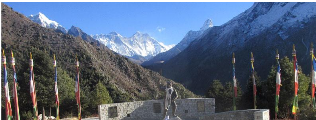
The View of Everest Himalayas