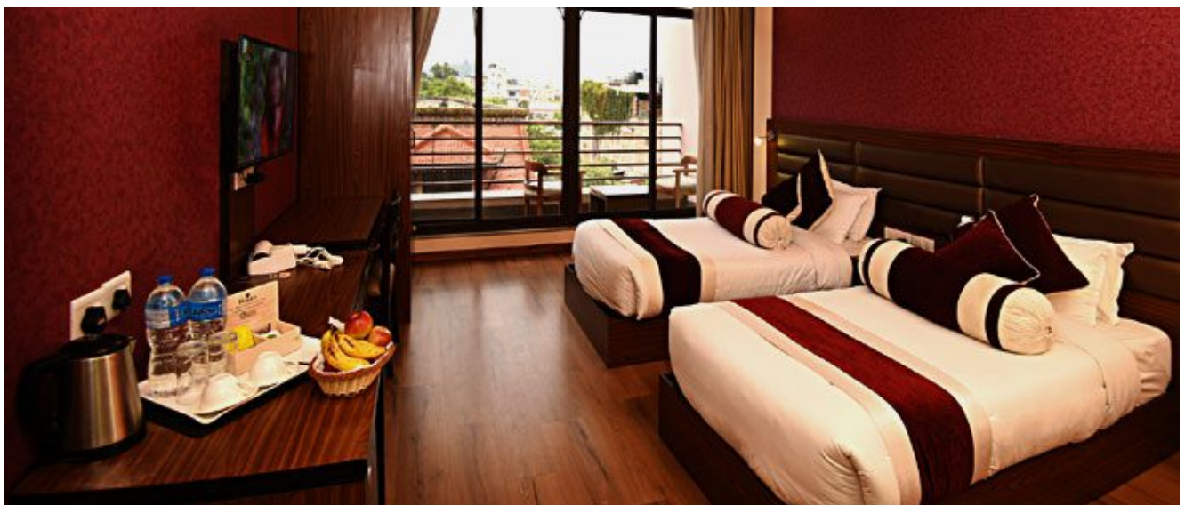
Bed Room on Hotel in Kathmandu

Later, while returning to the Hotel, you can go Shopping around the local market. There are too many different things to buy, but you may choose on your own. Overnight at the Hotel.