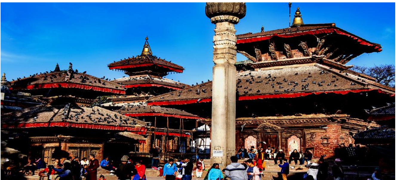
Kathmandu Pokhara Lumbini Tour Image

Sightseeing by car, driver, and guide during the day. Similarly, Lunch will be on the way, and dinner will be at the hotel. Overnight at a hotel in Kathmandu.