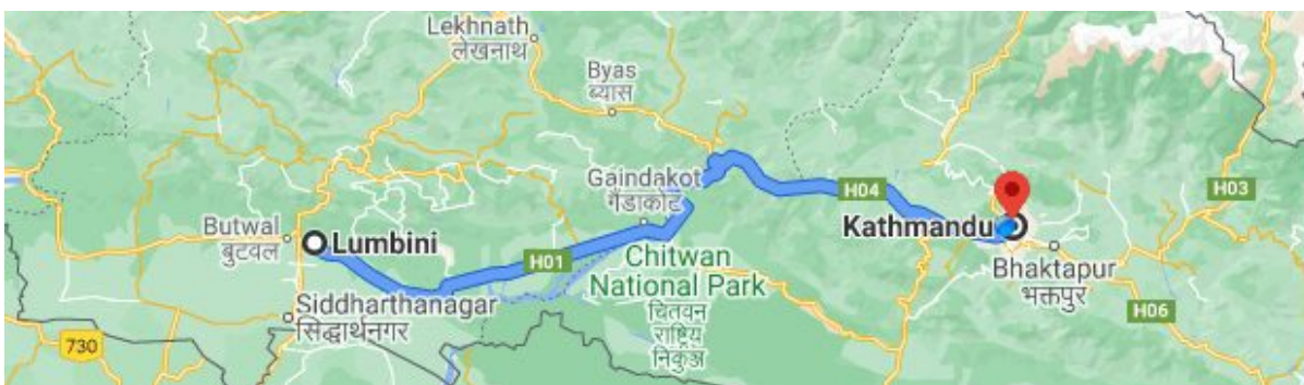
Driving Map from Lumbini to Kathmandu

Options: Some people would like to Fly from Lumbini to Kathmandu. It is 35 minutes flight.