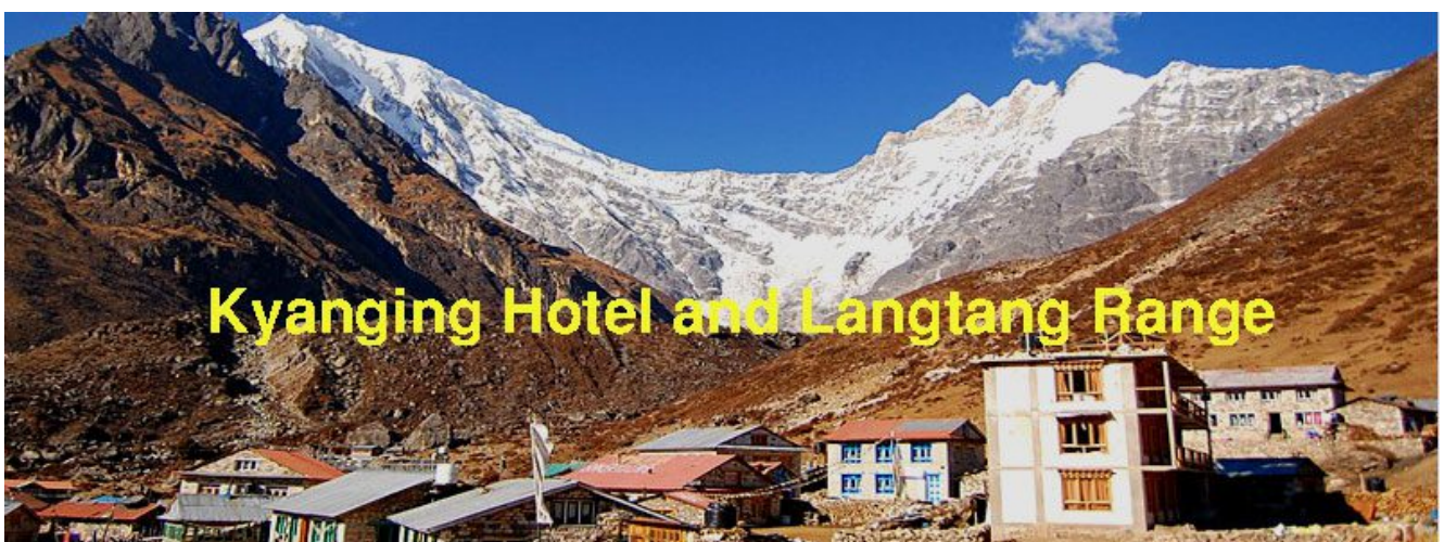
Kyanging in Langtang trekking

These are the enjoyable places to go for Langtang trekking. Whenever you arrive at Kyanjing Gompa, Have lunch and explore another Cheese factory. Overnight at the Hotel.