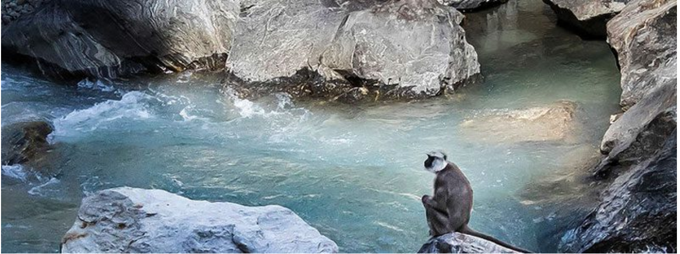
A Monkey by the River

If your knees are in pain, you may walk down slowly. Have lunch at the Ghoda Tabela and another two-hour walk to Lama Hotel, have dinner at the hotel and stay overnight at Lama Hotel.