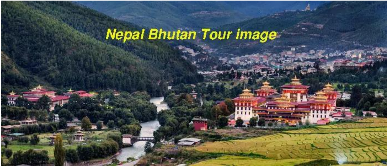
Nepal Bhutan Tour image