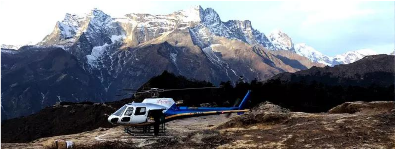
Mount Everest Base Camp Helicopter tour

After exploring, you will have breakfast in the Hotel. You will have a free day.