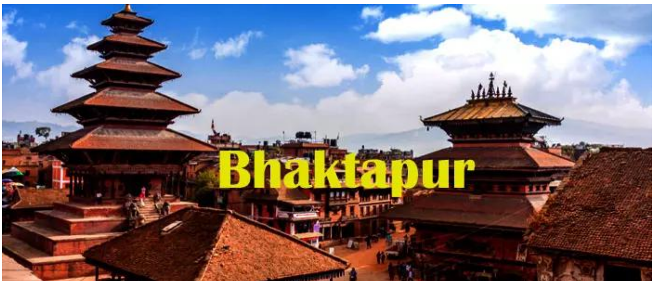
Bhaktapur Durbar Square

Then we end our day on a high note by visiting the Bouddhanath Stupa. We forget all the tiredness of our day in the serene stupa of Bouddhanath and head towards our hotel in Kathmandu.