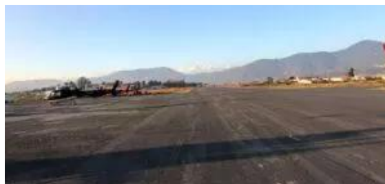
Tribhuvan International Airport

One of us will pick you up from the International Airport of Nepal and drive you to the Hotel. You will be accessible during the day in Kathmandu.