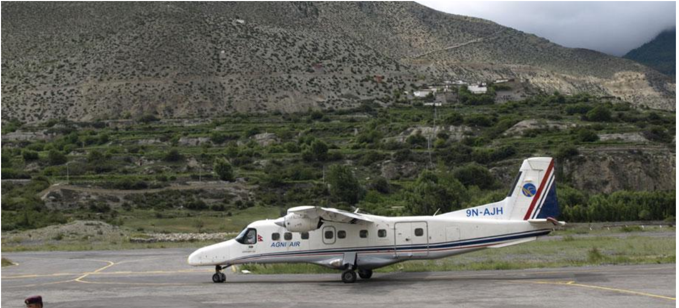
Jomsom Muktinath Trekking airport Photo