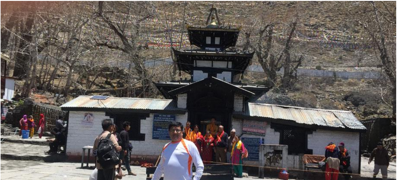
Nepal Pilgrimage Tour, Muktinath Temple